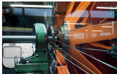
On the winding machine, the press hoses receive a stainless steel braid. It gives the hoses high pressure resistance without restricting flexibility