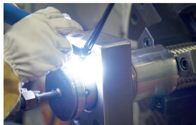
Manual welding of the special flange connection